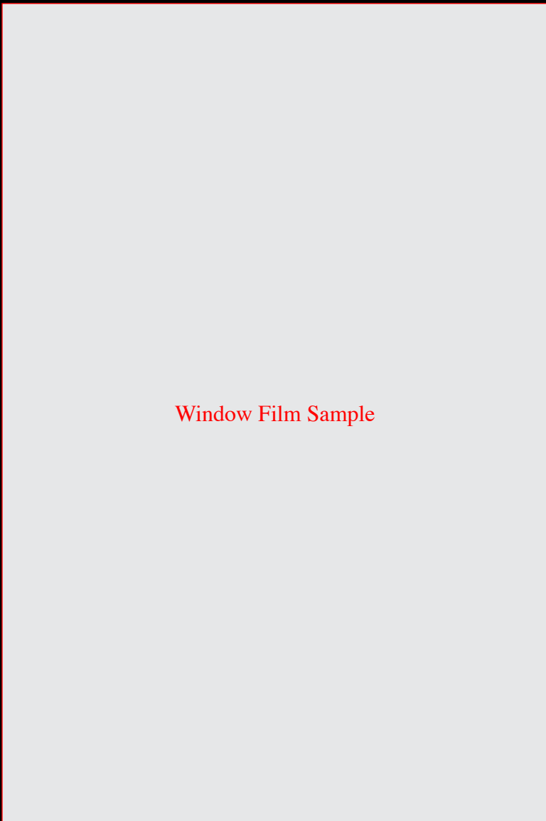
Window Film Sample